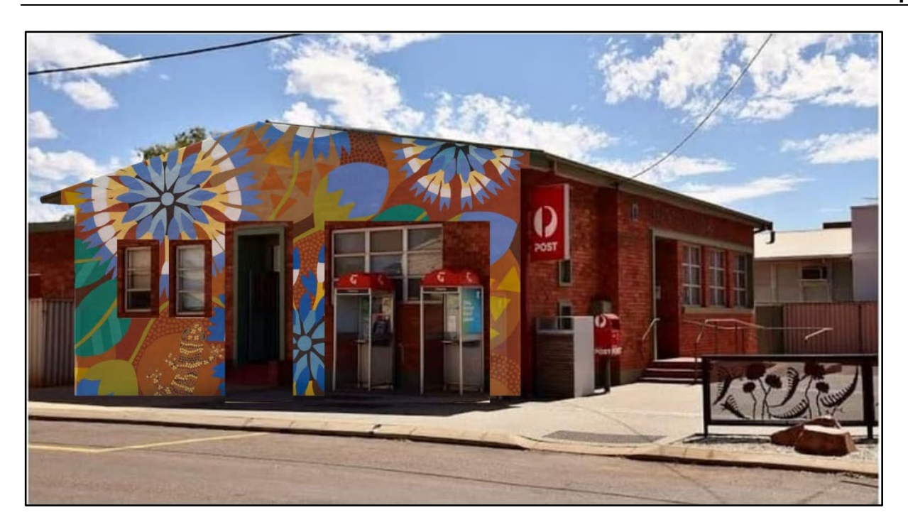
Prater Street Design