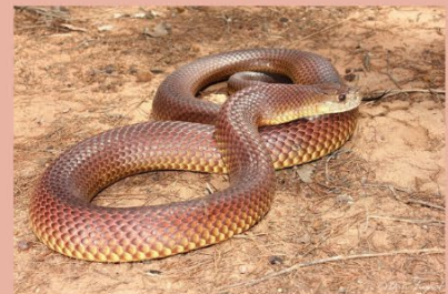
King Brown (Mulga)

DO NOT ATTEMPT TO CATCH, HANDLE OR KILL SNAKES!