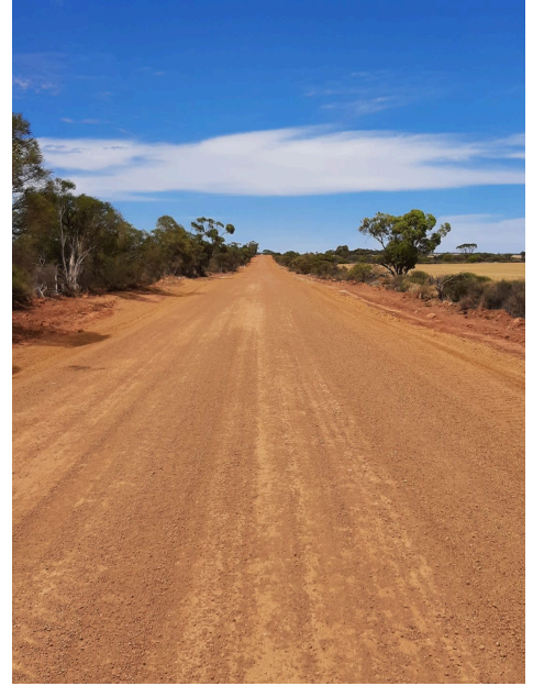
Completed resheeting on Collins Road.

Both graders are busy completing maintenance around the Shire, and we ask that during this harvest period that any trucks please slow down and advise drivers when passing using channel UHF 40.