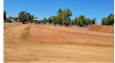
Site works at Solomon Terrace