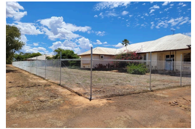
New fencing at the Old Hospital

Work on the Solomon Terrace Community Precinct is continuing, preparations are being made for new parking and access bays, drainage, and the installation of new solar lighting. New fencing has also been erected around the old Hospital.