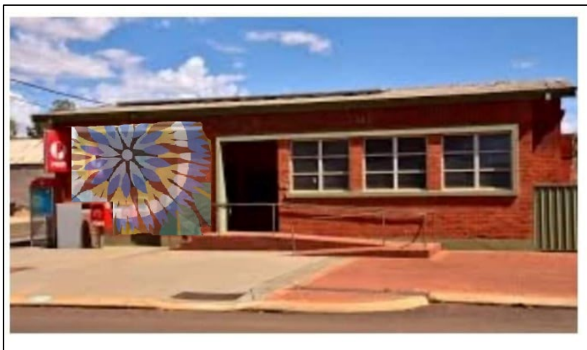
Winfield Street Design

The artwork is proposed to commence in May 2022. The intended artwork will be colourful, contemporary aboriginal art in dot formation showcasing flora and fauna. With background red brick being incorporated into the proposed design.