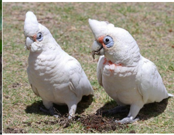
Eastern Long Billed Corella