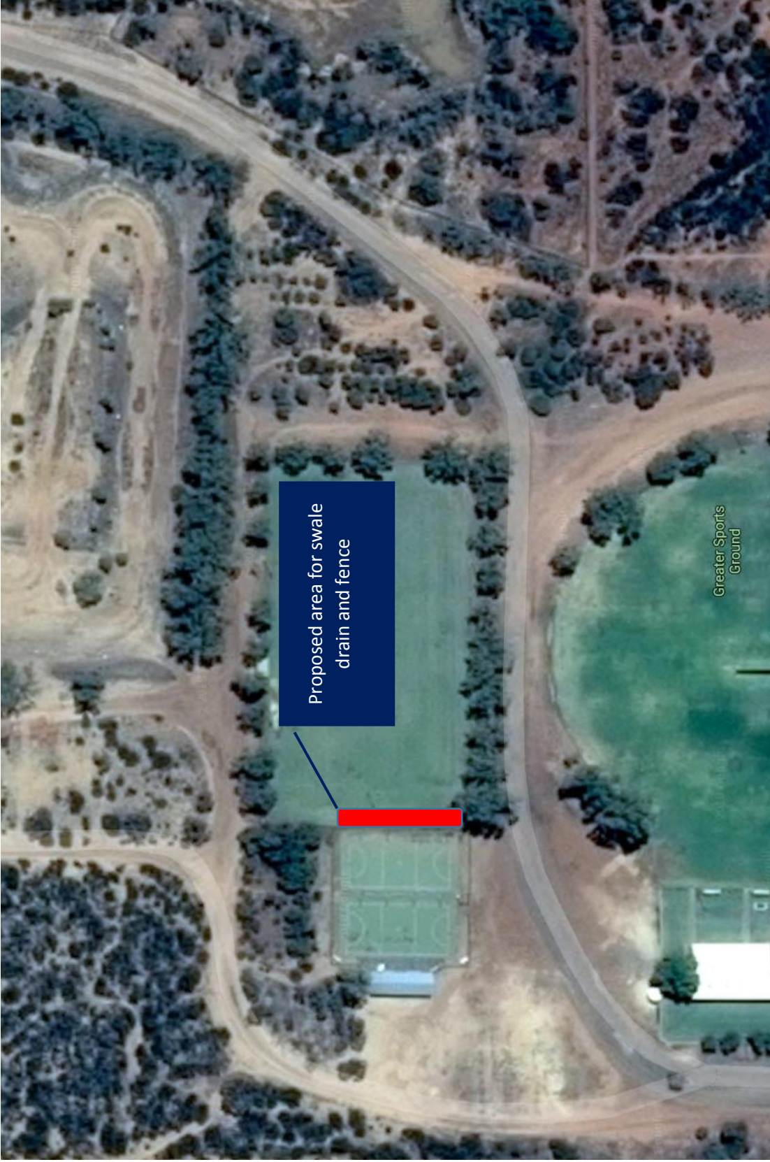
Figure 1 - Proposed area for swale drain and fence