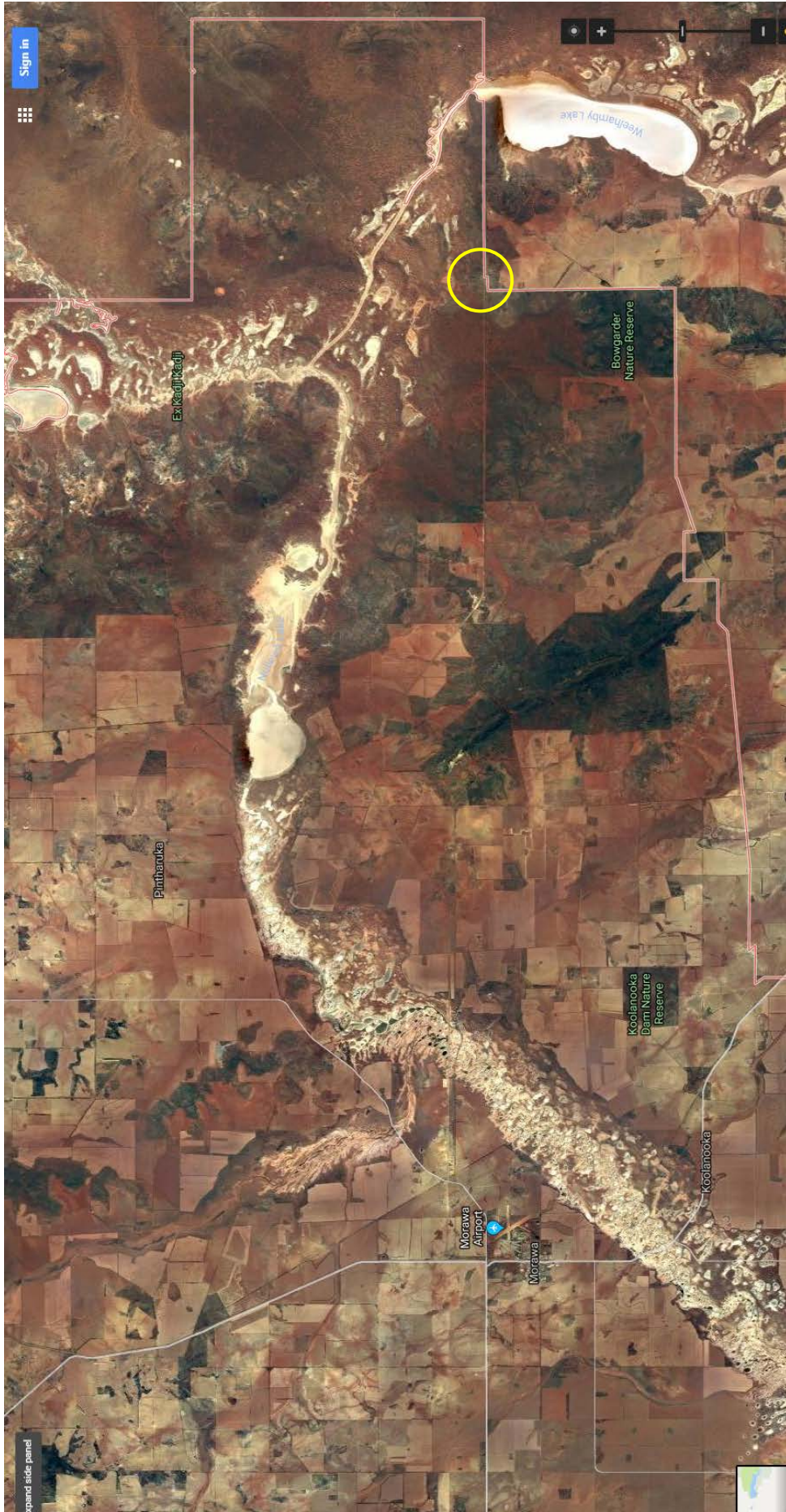
7.2.5.2a Plan showing affected section of Mungada Road